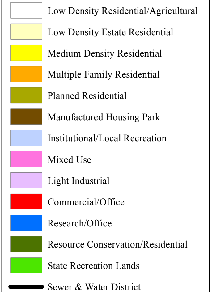
MAP 10 FUTURE LAND USE